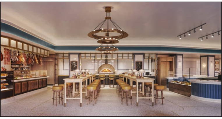
Cipriani at Waterline Square

I think when you look at these various projects, you see we've developed a reputation and a history of doing things a little differently, arguably a little better, than what is happening in a given marketplace. We build projects that are of a higher quality. We have a very long-term hold mentality. We're not merchant builders. We don't flip properties. We hold them for,