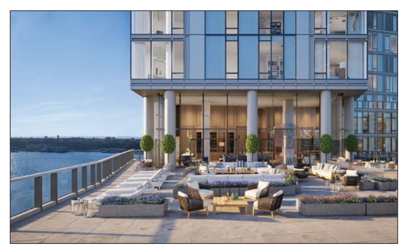
Two Waterline Square Amenity Terrace

250,000 square feet of new office space, as well as new streets, parks and public spaces. High Street in Atlanta is almost twice as big. That's probably a $2.5- to $3-billion project across 42 acres. We secured entitlements that allow us to build up to 3,000 residential units, 400,000 square feet of retail, restaurant and entertainment space, approximately a million square feet of office and up to 400 hotel rooms. The project