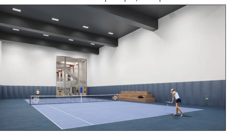
Indoor Tennis Court at The Waterline Club

every developer lived adjacent to their development sites, projects would be developed differently. Waterline Square is the last piece of the puzzle of the larger masterplan known as Riverside South that runs from 59th to 72nd Street. I actually started my career on that project when I came out of graduate school in the '90s, so I have a real personal obsession with the completion of that masterplan, and the Waterline Square project in particular.