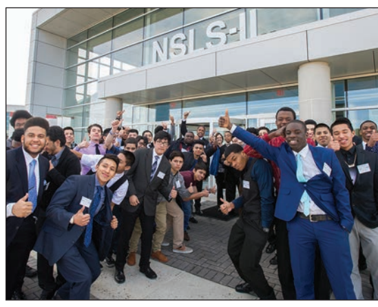
Students at the National Syncbrotron Light Source II, the brightest light source of its kind for exploring materials in ways never before possible.

With the brightness and brainpower at NSLS-II and the Center for Functional Nanomaterials (CFN), which is a complementary facility a short walking distance from NSLS-II, we are developing the ability to study processes "in operando," in real-world operating environments with authentic pressures, temperatures, and electric fields, instead of isolating them in pristine vacuum chambers and ultraclean lab environments. We can identify strengths and weaknesses of battery materials by watching internal processes as they happen, rather than