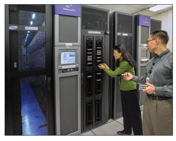
Brookhaven Lab is home to the second largest scientific data archive in the entire United States and the fourth largest in the world.

We're locating the cryo-EM instrumentation at NSLS-II, where we now have a suite of advanced imaging capabilities for biological structures, thanks to funding from the National Institutes of Health. This integrated suite of imaging tools incorporating X-ray techniques at the NSLS-II beamlines and complementary cryo-EM tools will allow us to solve the structures of biomolecules at a greatly accelerated pace, which has the potential to accelerate the design of new drugs. This research – and doing it quickly and cheaply – could be a game-changer for industry.