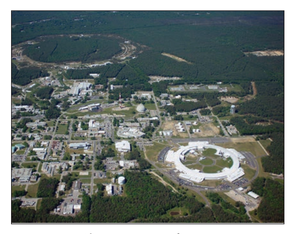
The U.S. Department of Energy's Brookhaven National Laboratory on Long Island.

propel decades of future discovery and help the U.S. maintain its leadership in the field of nuclear physics, accelerator technologies, and more.