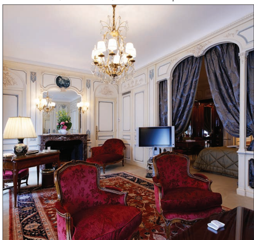
{\it A few of the sumptuous suites at the Hotel Raphael}

Hotel Raphael offers a series of luxurious suites to choose from, where glamour and prestige unite. The suites strike the perfect harmony between authentic architecture and modern amenities. With traditional wood paneling, moldings, and decorating paint from 1925, the suites transport guests to a world of style. Unique hand-painted tiles and bright glass doors make up the elegant bathrooms, while sophisticated furnishing fabrics and curtains by 'Rubelli' et 'Lelièvre' adorn the suites. First-rate in-room guest room features vary to include free Wi-Fi; VIP Welcome pack (children's versions available); flat-screen satellite TV with pay-perview films; fax, voice mail, and DVD player; flower arrangements; VIP welcome; 24-hour room service; hypoallergenic pillow (on request); and extra beds (double or twin) available on request. ●