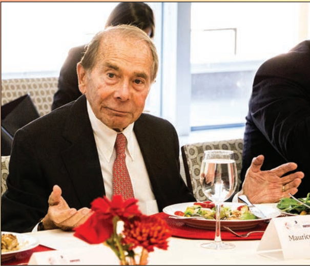
Event host Hank Greenberg of Starr Companies

LEADERS Magazine and China General Chamber of Commerce – U.S.A. (CGCC) hosted a lunch with Maurice (Hank) Greenberg and Starr Companies that brought together a group of senior executives from China's leading companies.