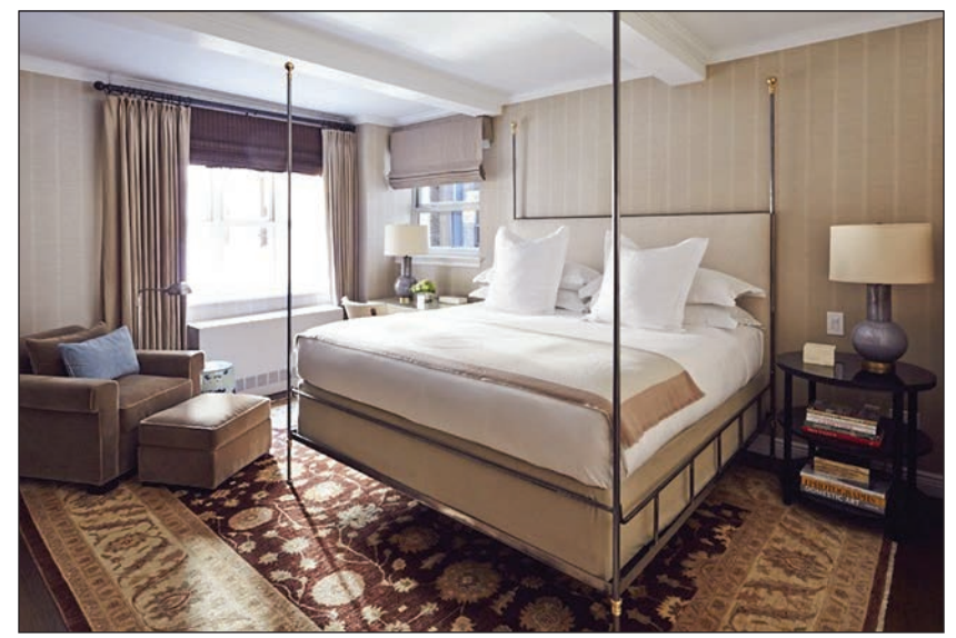
Luxurious Lowell suite living area (top right); bedroom (above); bathroom (below); and an inviting snack to enjoy in front of the fireplace (right)

The Lowell offers guests an array of suites to choose from for an ultimately inclulgent stay.