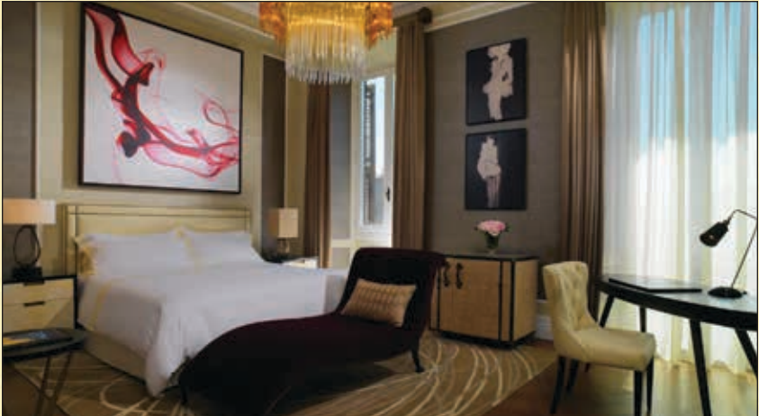
Top to bottom, left to right: The St. Regis Rome facade; entrance, lobby; the Salone Ritz ballroom; the Adornetto meeting room; the Royal Suite bedroom; Ambassador Couture suite bedroom