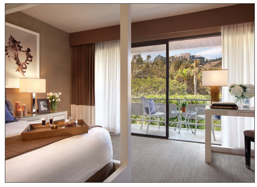
Executive Suite living area, bedroom, and bathroom