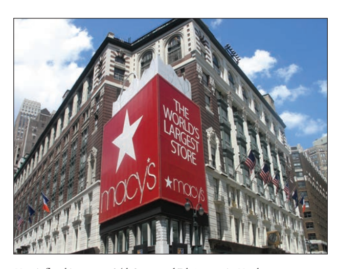
Macy's flagship store at 34th Street and 7th Avenue in Manhattan

We have been in New York for 155 years so it is our first commitment, and this is our flagship so we are well-represented with important Macy's and Bloomingdale's stores throughout the five boroughs. We have 16,000 employees working in those five boroughs and a payroll of $1.5 billion. As a company, there is a great deal of pride among our employees about giving back to charity organizations and schools in this city.