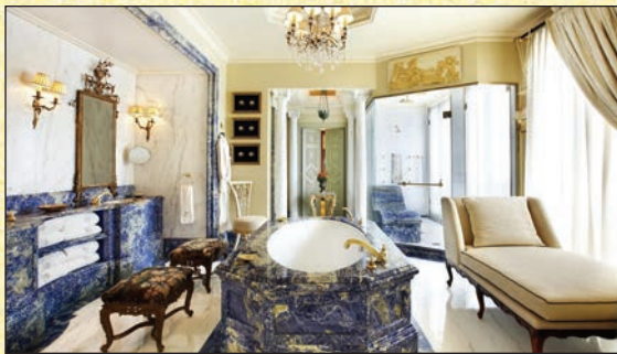
Clockwise from top left: the hotel's historic facade; the lobby reception area; the spa's herbal aroma steam bath; Presidential Suite bathroom, dining room, living room; Royal Suite living room, dining room, bathroom; view of the Acropolis from GB Roof Garden Restaurant & Bar

Located on the fifth floor of the property, the sprawling one-bedroom, two-bathroom Royal Suite boasts a triple living room with three inviting sitting areas and an extravagant private dining room that can host up to 16 guests comfortably. Guests will appreciate the use of a private gym as well as a private media room. The suite's exclusive wine cellar is available to guests for the entire length of stay, as is a traditional humidor filled with a world-class selection of tobacco. The Royal Suite, which connects with two Grande Deluxe Suites, offers exceptional butler service at the touch of a button. ●