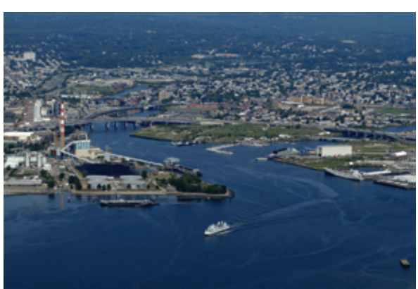
The ferry departing from Bridgeport Harbor