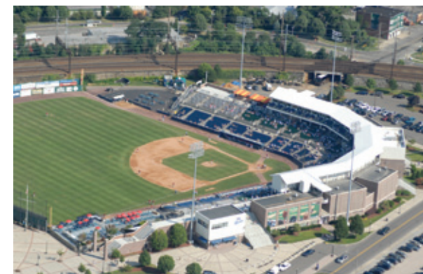
Bridgeport Bluefish Baseball Stadium at Harbor Yard