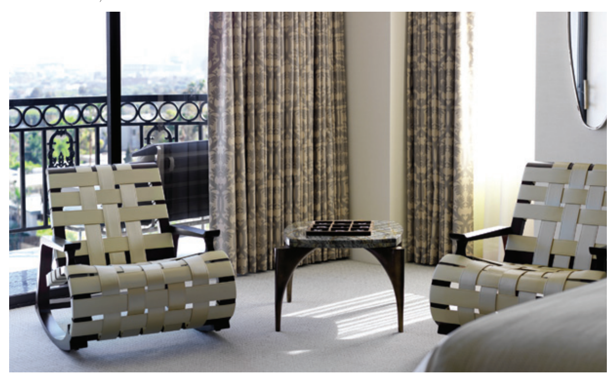
Counterclockwise from upper left: One-Bedroom Suite private terrace; bed; bathroom; living area

Guests seeking the best the property has to offer may request the One-Bedroom Suite. At 1,250 square feet, the space encompasses a living room and separate bedroom connected via an internal door, which can be closed and secured. The bedroom offers a king bed dressed in luxury Italian linens, facing an unobstructed view through a private terrace to the West Hollywood landscape, while the separate living area offers an ergonomic work desk, dining area, chaise sofa, and an additional terrace with outdoor seating. Both rooms feature their own bathrooms, marble-topped desks with convenient docking outlets for laptops and cell phones, complimentary wired and wireless high-speed Internet access, iHome iPod docking stations, two-line speaker phones with voice mail, and LCD flat-screen televisions. •