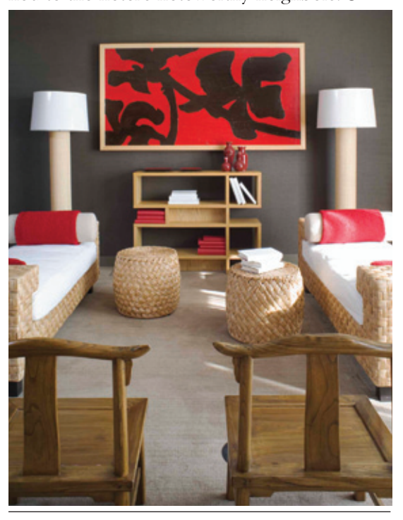
Vista Suites of: Luxe Sunset Boulevard Hotel (left); Luxe Rodeo Drive Hotel (center); Luxe City Center Hotel, Los Angeles (right) See more at www.luxebotels.com

THE NEWEST LUXE HOTEL IS THE LUXE City Center Hotel, Los Angeles an upscale, design driven boutique hotel in downtown Los Angeles, that offers a tranquil retreat in the heart of L.A.'s newest entertainment district the hotel is two blocks south of the Convention Center, and steps from the STAPLES Center, and the NOKIA Theater L.A. Live complex. Newly redone, the Luxe City Center Hotel, Los Angeles features 15 unbelievably beautiful suites with impressive views of the Los Angeles skyline and stunning design elements all personally selected by the hotel's owners. Decorated in subtle tones of aqua and camel in a style that can be described as "elegant but with an attitude," artwork plays a key role in defining the hip, urban feel and energy of the rooms with graphic depictions of iconic music and sports figures in a nod to the hotel's noteworthy neighbors.