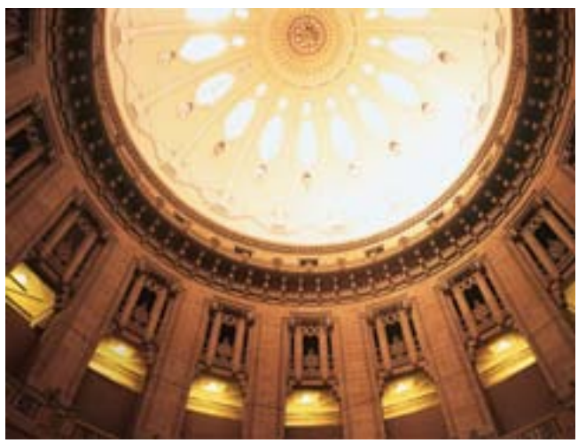
Page one: Umaid Bhawan Palace (beader); Maharani Suite bedroom (bottom); Page two: Outdoor pool (top); Baradari dining experience (center); Palace's Rotunda dome (bottom)

school, but we need a coed day school, and a professionally managed hospital that also has some training facilities for nurses and medical students. •