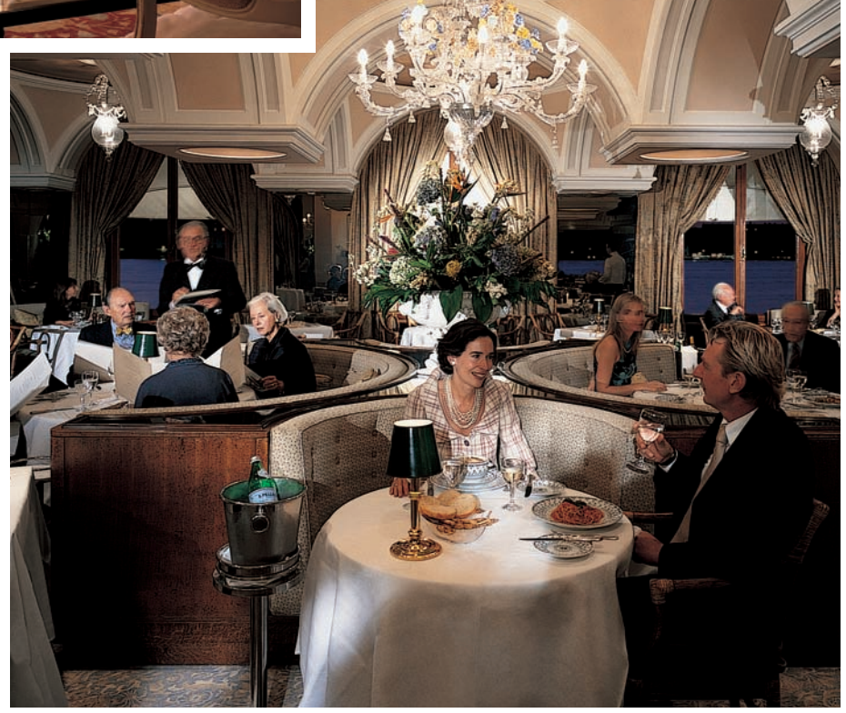
Hotel Cipriani's Vendramin Palace suite (upper left); The largest hotel swimming pool in Venice at Hotel Cipriani (top right); Hotel Cipriani's Fortuny restaurant — the "in" place to dine (bottom right); This could be you having dinner in the Orient-Express dining car (left)