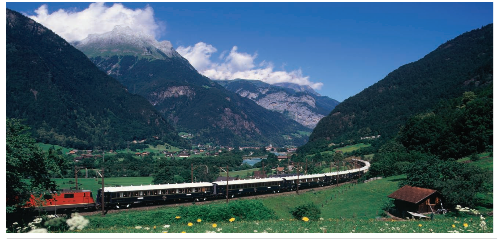
Luxurious compartment — and they are all like this on Venice Simplon-Orient-Express train (top); The Orient-Express passing through Lucerne. Look closely, that might be you in the third car