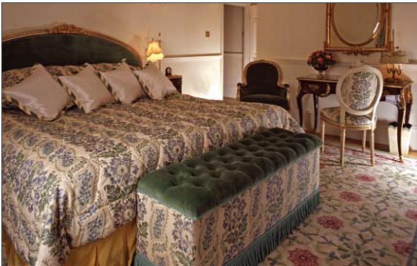
Clockwise from top left: the Royal Suite bedroom; the Royal Suite living room; The Prince of Wales Suite living room; and the Arlington Suite bedroom

Guests in the residential suites in William Kent House can expect the same service for which The Ritz is renowned. For instance, residents in these specialty suites also enjoy the services of The Ritz Butler – guests in the Royal and Prince of Wales Suites do so on a complimentary basis. The Ritz maintains a staff-to-guestroom ratio of two to one, and 24-hour room service and concierge, as well as housekeeping services ensure the personalized attention to detail that epitomizes the luxury and comfort of every stay at The Ritz. ●