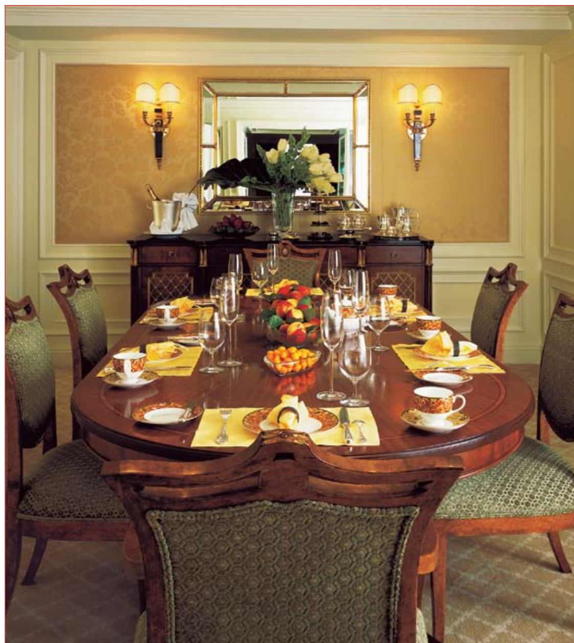
The living area (top left), bedroom (top right), and dining room (right) of the Ritz-Carlton Suite

Located on the third floor of the hotel, directly overlooking the New York landmark for which it is named, the Central Park Suite measures 1,900 square feet and features one bedroom, one and a half bathrooms, two living rooms, a large entry foyer, and a dining room with an adjacent pantry and private service entrance. The suite is also appointed with such lush amenities as 700-thread-count linens, linen and terry robes, and Frette candles – not to mention a marble soaking tub, with a separate stall shower. An in-room safe, wireless Internet access, and a multiline cordless telephone with voicemail and data-line capabilities provide guests with modern-day conveniences, as they ensconce themselves in the suite's luxurious surroundings. As with the Ritz-Carlton and Royal Suites, an adjoining bedroom with bath is available upon request. In addition, guests of all three suites receive complimentary access to the Ritz-Carlton Club Lounge. ●