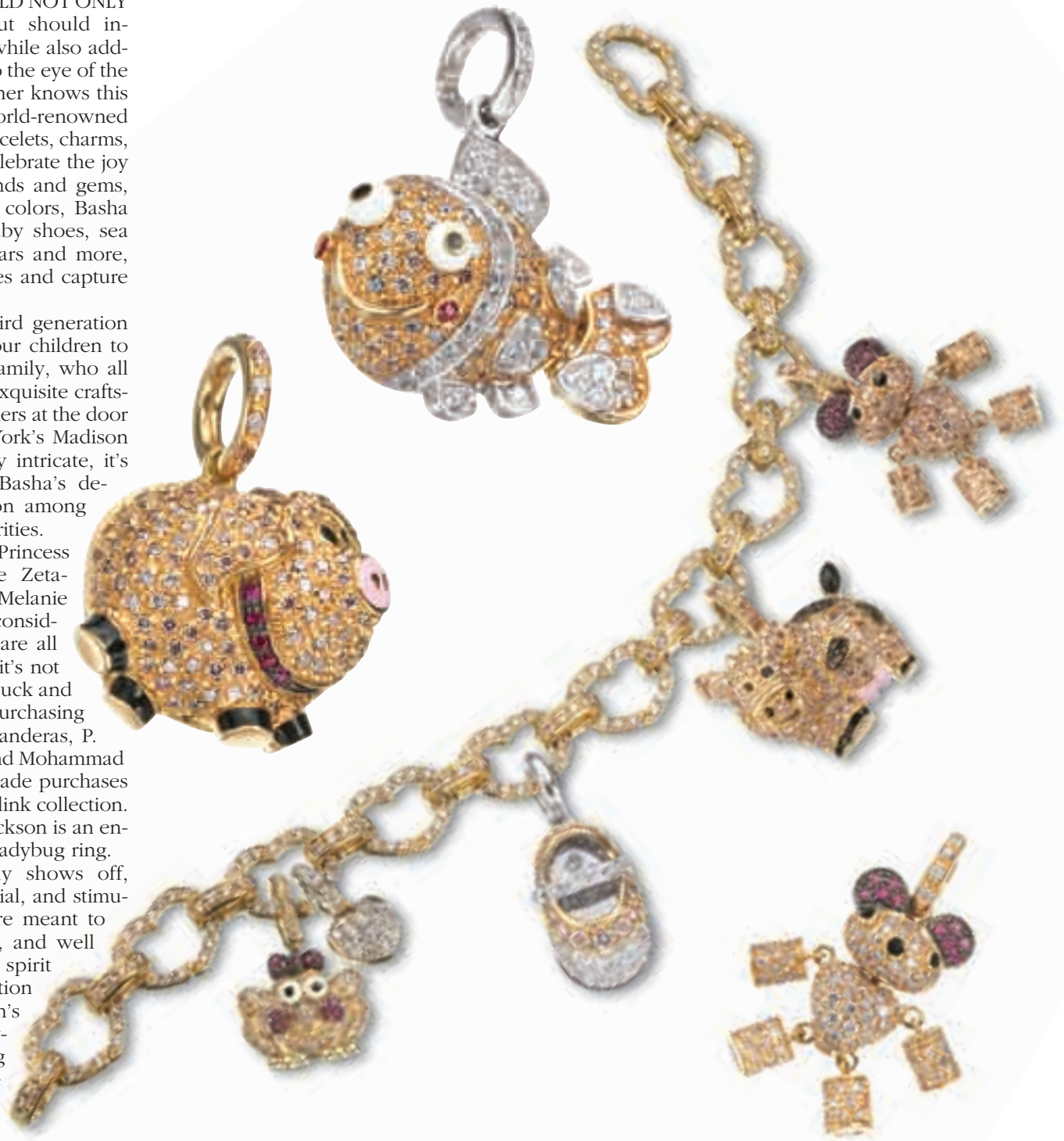
Charms and a necklace from Aaron Basha's new Rose Gold Collection