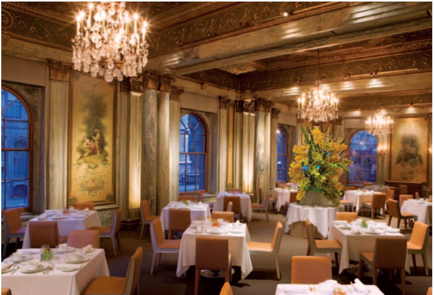
The Madison Room

"As the former residence of Pennsylvania railroad magnate