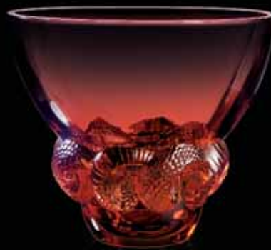
Some of the many creations from the Mythic Garden collection: box (top left); pendants (top); Boa vase (above); bowl (right and below)