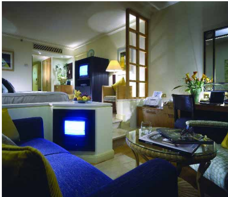
Clockwise from top: Tower Room lounge; La Veranda Restaurant; Dafna Hall; a room in an Executive Suite