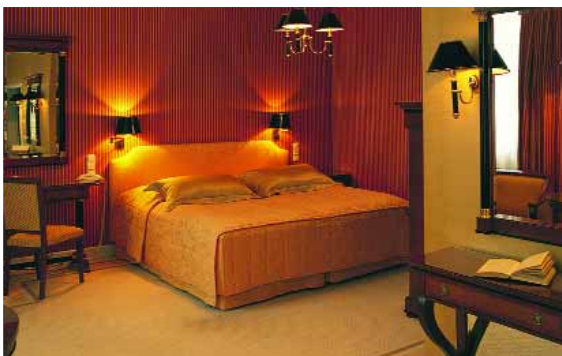
Clockwise from top right: the hotel's exterior; the serene infinity pool; Presidential Suite bedroom and living room; lobby