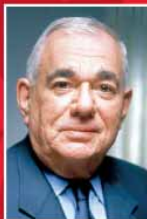
ELKIN 70 CORPORATE GLOBAL TRADING