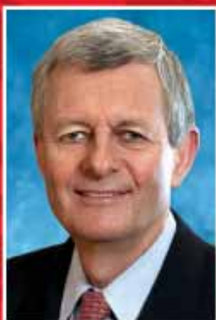
MCKINNELL 54 HEALTH