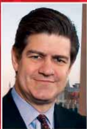
TURLEY 26 PROFESSIONAL SERVICES