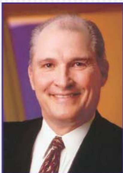
MACINNIS The World's Largest Specialty Contractor 18