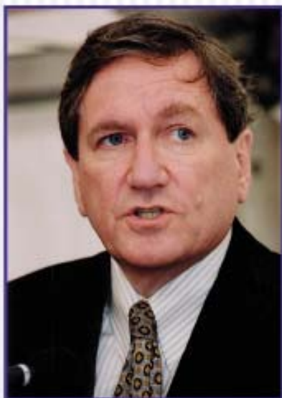
HOLBROOKE Iraq, Mandela, and Peace 10