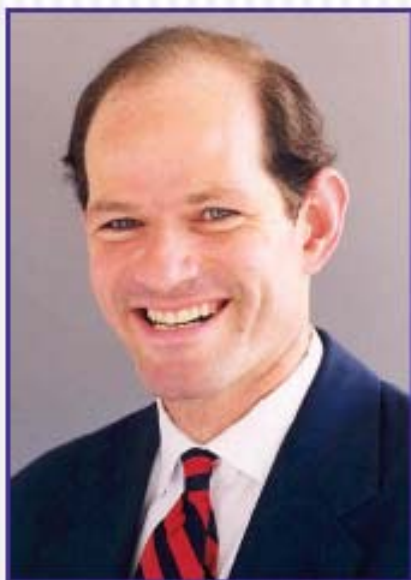
SPITZER Is It Over? 15