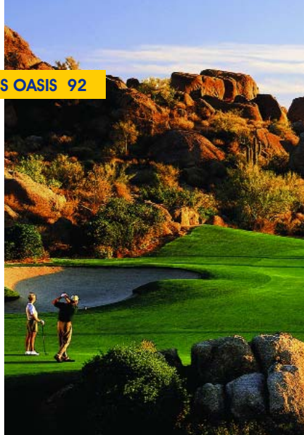
A GOLFER'S OASIS 92