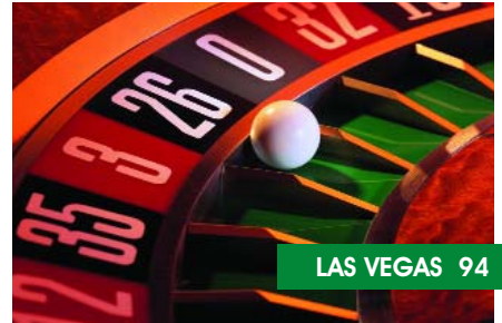
LAS VEGAS 94

The Honorable Oscar B. Goodman, Mayor 94