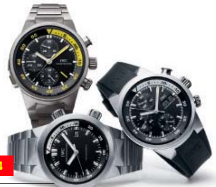
LEADERS STYLE 104