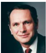
THE LANESBOROUGH GEOFFREY GELARDI THE LANESBOROUGH, A ST. REGIS HOTEL, LONDON