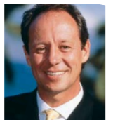
FOUR SEASONS THOMAS STEINHAUER FOUR SEASONS HOTEL NEW YORK