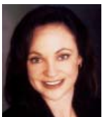
INTERCONTINENTAL JENNIFER FOX INTERCONTINENTAL HONG KONG