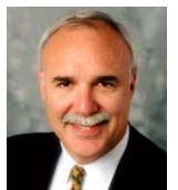
NEW YORK PALACE JOHN SEGRETI NEW YORK PALACE