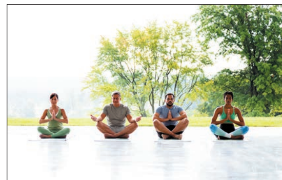
Fireside Lounge (top right); indoor pool, salon, yoga and meditation (above - left to right); fitness center, facial, massage (below - left to right)

From transformative, cutting-edge signature therapies and traditional, holistic practices to pure, unadulterated luxury spa treatments, guests of the Woodlands Spa and Salon at Nemaocolin ( nemaocolin.com ) define what self-care and wellness mean to them, and then discover unique offerings and special services they won't find anywhere else to relax, rejuvenate, and indulge.