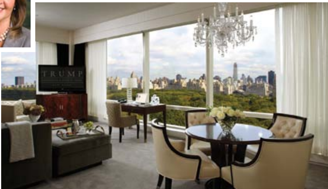
Clockwise from left: Entrance; interior of Jean Georges; Guest bedroom; Two bedroom Park View Suite; Suzie Mills